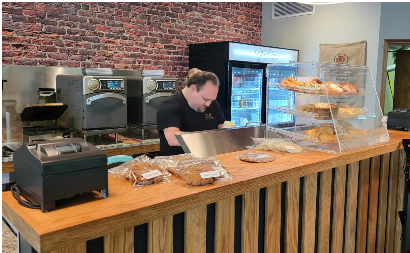
The Gather + Grounds coffee bistro gives Rising Star Academy culinary students a chance to hone their social skills.

“Sometimes we make jellies and things like that too that we sell.”