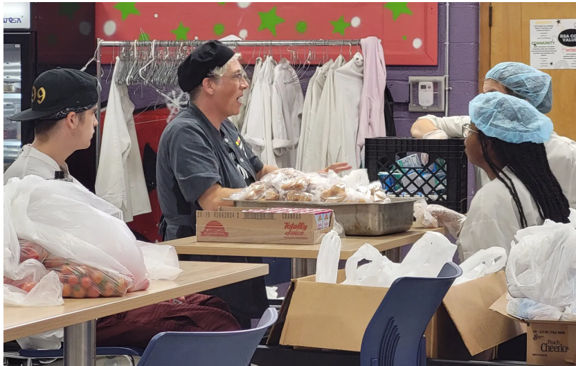
Culinary students at the Rising Stars Academy in Center Line prepare meals for distribution.

Gather + Grounds offers social skills development, work experience