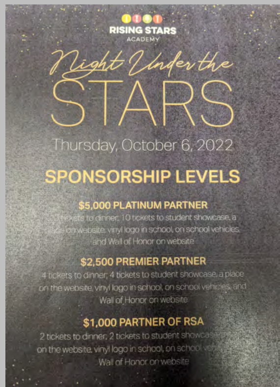
Night Under the Stars Sponsorship Information